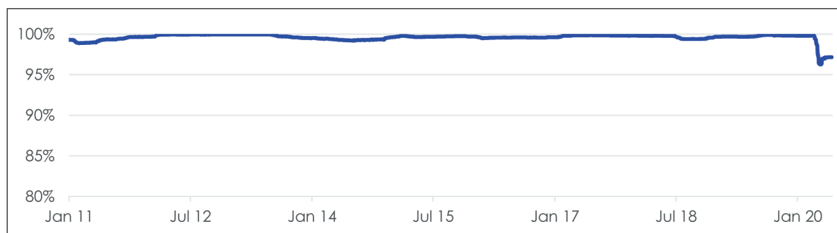
Figure 2: One-year rolling correlation between the Multi-Tenor Index and the Original Index

1 st January 2010 to 12 October 2020. Using daily returns and calculating over 252 business days for each period. Above numbers include back-tested data. Historical performance is not an indication of future performance and any investments may go down in value.