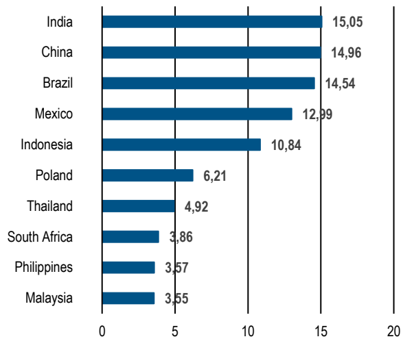
Top 10 Currency Exposure (%MV)