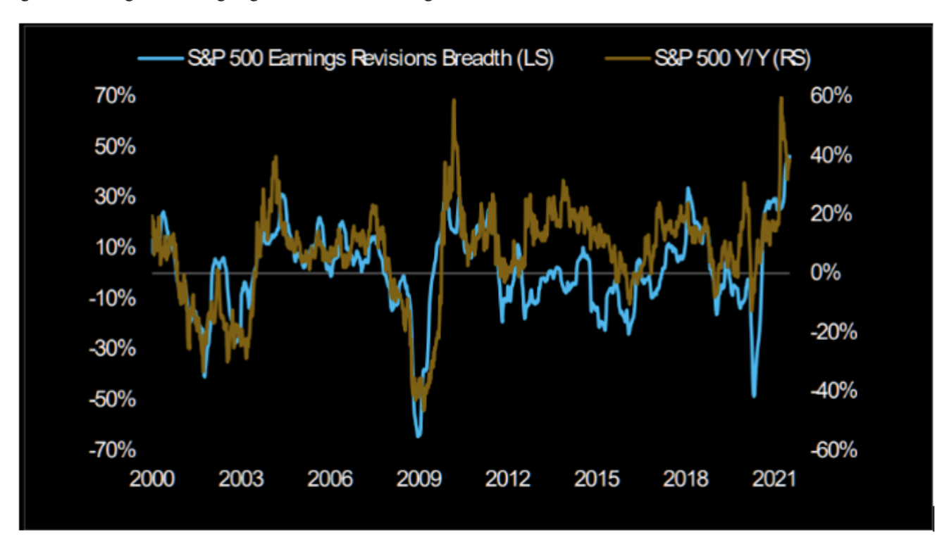
Figure 2: Getting the Earnings right is salient to deciding what is value.

The big assumption in the above statement is that you have gotten the "E" right. As we know, Mr Market is a discounting mechanism, evaluating the present value of future expectations and backward-looking data is not always as useful.