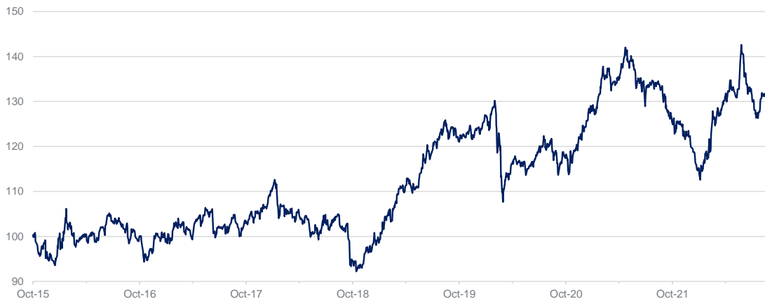
Quantica Managed Futures R1C-E (DPQR1CE LX)