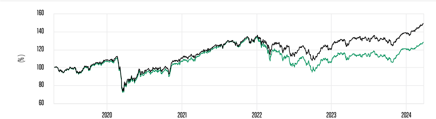
Cumulated Performance at 28.03.2024 (%)