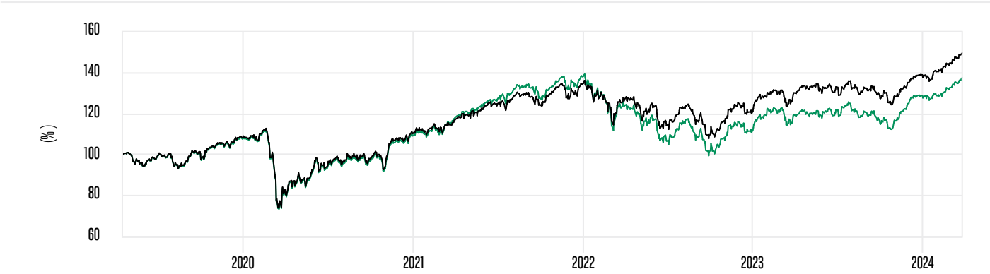
Cumulated Performance at 28.03.2024 (%)

(1) All figures net of fees (in EUR). (2) Based on 360 days