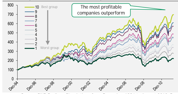
Simulations from December 1994 to August 2012. Past performance is not a guide to future performance.

Criteria example: Return on Economic Asset (companies listed in US)