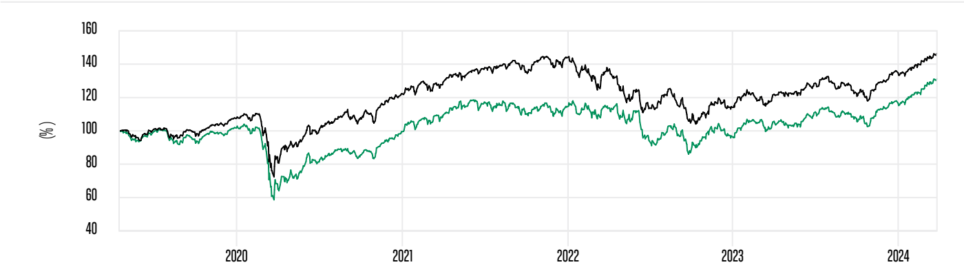
Cumulated Performance at 28.03.2024 (%)

(1) All figures net of fees (in EUR). (2) Based on 360 days