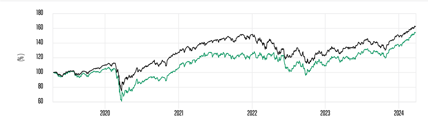
Cumulated Performance at 28.03.2024 (%)

(1) All figures net of fees (in USD). (2) Based on 360 days