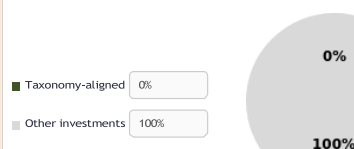
1. Taxonomy-alignment of investments including sovereign bonds*