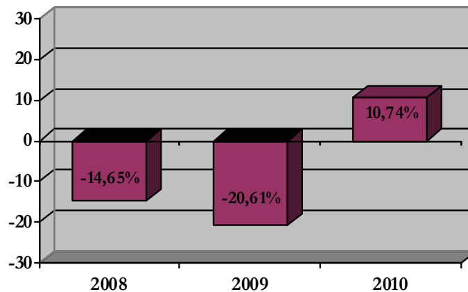
Davis Opportunities Fund Fiscal Year 31 July Total Returns for Class A Shares